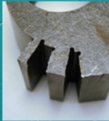
Part cut without Dynamic Waterjet™, showing taper