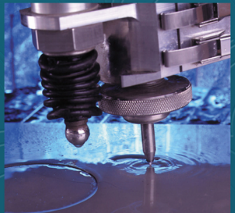
Cut with Dynamic Waterjet™