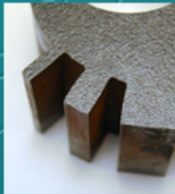
Part cut with Dynamic Waterjet™, showing elimination of taper